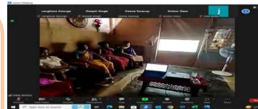
Glimpse of a training session happening in Kolaghat, Assam